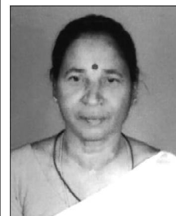
Late B. Vijaya Laxmi